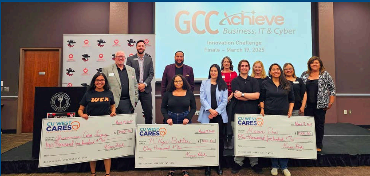
GCC Innovation Challenge