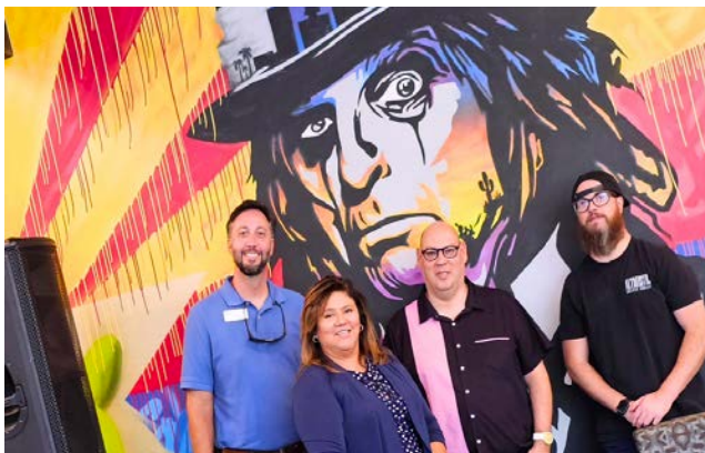
Alice Cooper Teen Center