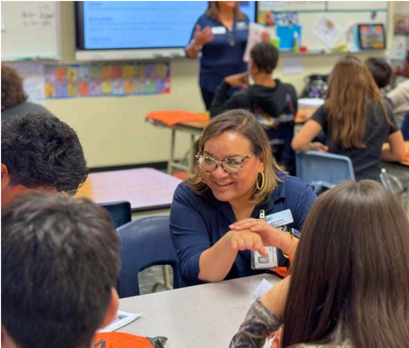
GESD Financial Education