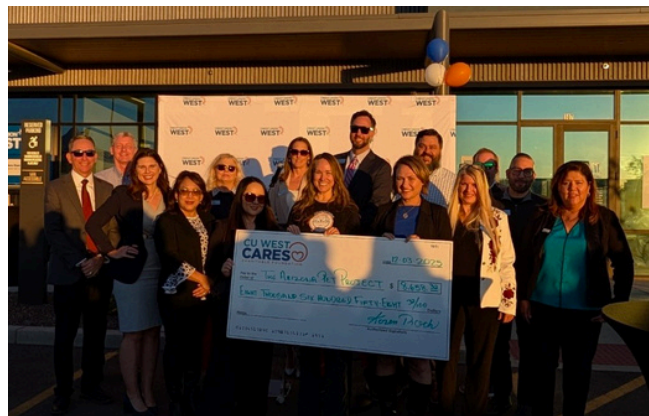
The Arizona Pet Project