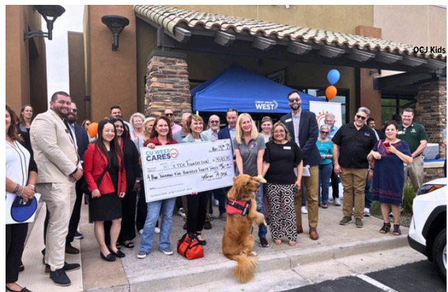
The Fetch Foundation