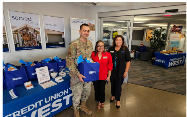
Luke AFB Branch Anniversary