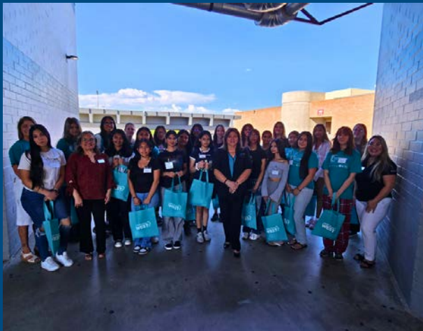
ACEE Invest in Girls

These efforts allow Credit Union West to support initiatives that bring people together, promote financial education, and contribute to stronger, more resilient communities across Arizona.