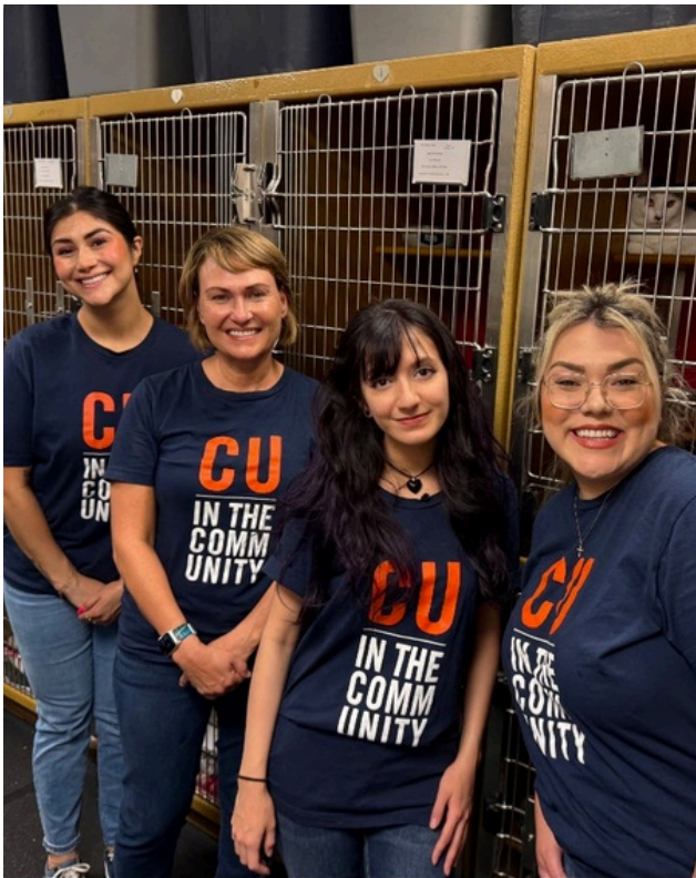
HALO VTO Event