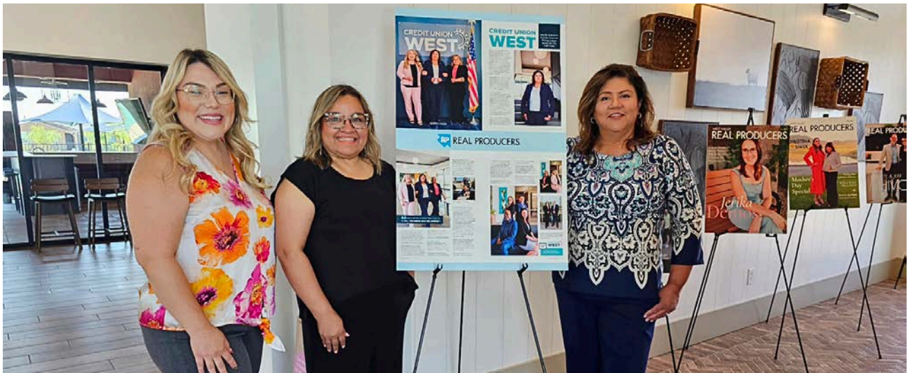
WESTMARC – 35th Best of the West Sponsors