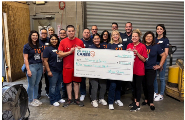
Sounds of Autism

"When we empower families who are struggling with an Autism diagnosis, we are setting them up for a fruitful future - strengthening our community through education, care, and good will." - Sounds of Autism