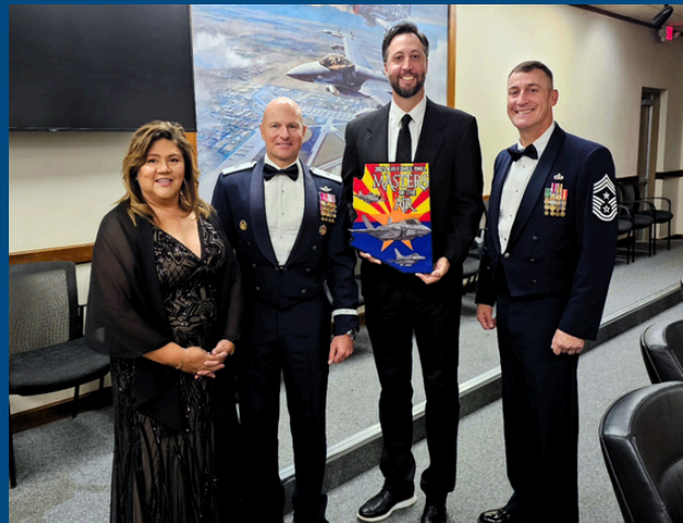
Luke AFB Air Force Ball