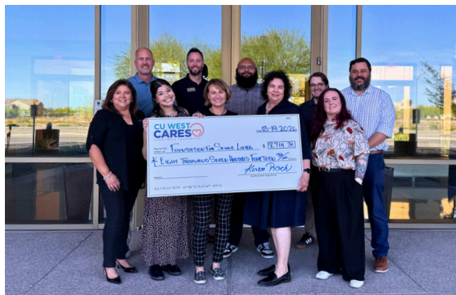
Foundation for Senior Living