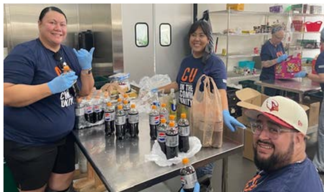
Member Contact Center Team – Valley View Community Food Bank