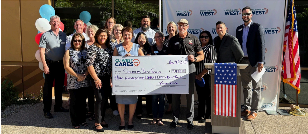
Soldier's Best Friend

"The difference an animal can make in our lives is truly profound. This program offers a compassionate way for our brave service men and women to rebuild their lives with the help of a devoted pet who often becomes family." - Soldier's Best Friend