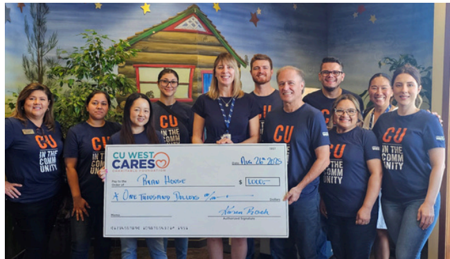
Ryan House VTO Event