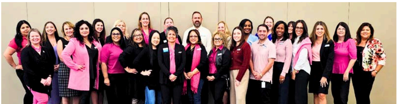
Global Women's Leadership Network – Q4 Meeting